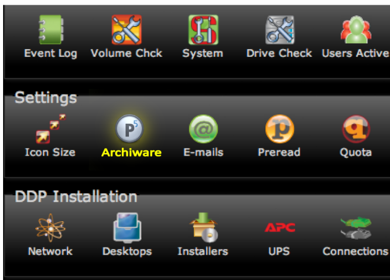
DDP48D with Archiware backup license with optional SAS card