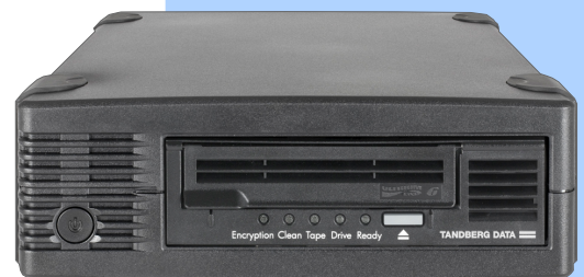
Tandberg LTO Tapestreamer