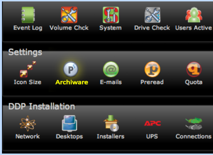
DDP main menu with P5 icon

The DDP48D is synchronized to the mirror DDP using Archiware synchronization licenses